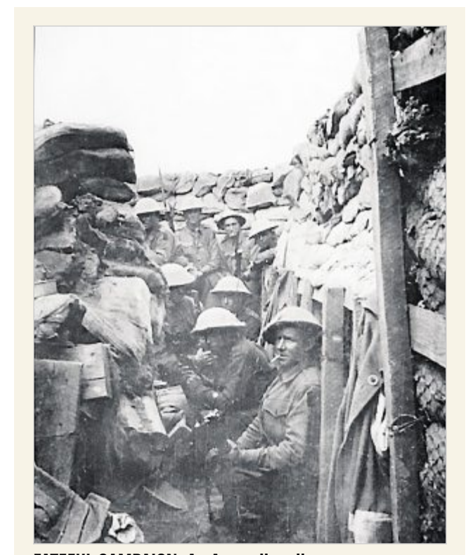
FATEFUL CAMPAIGN: An Australian digger uses a periscope in a trench captured during the attack on Lone Pine, Gallipoli, August 8, 1915.